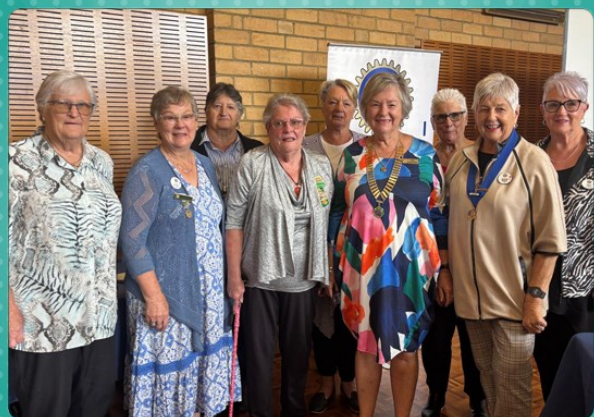
A62 District Meeting 5th April 2025 at Drouin