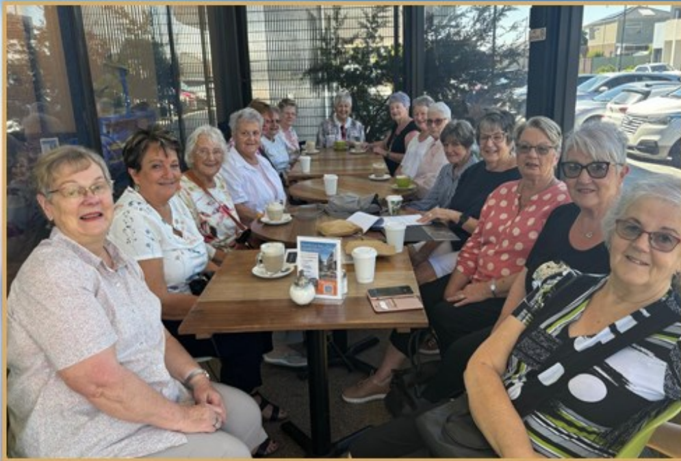
Morning Coffee at The LimeBox 21st November 2025