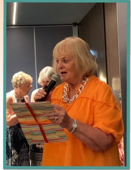
Narre Warren's Auction 23.11.24 - held at the Pink Hill Hotel

Planning is underway for our combined meeting on the 29 th April, 2025. When details are finalized we will let you know, but in the mean time please SAVE THE DATE.