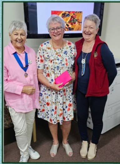
Bad luck Bron maybe next time That elusive Queen !!!!!