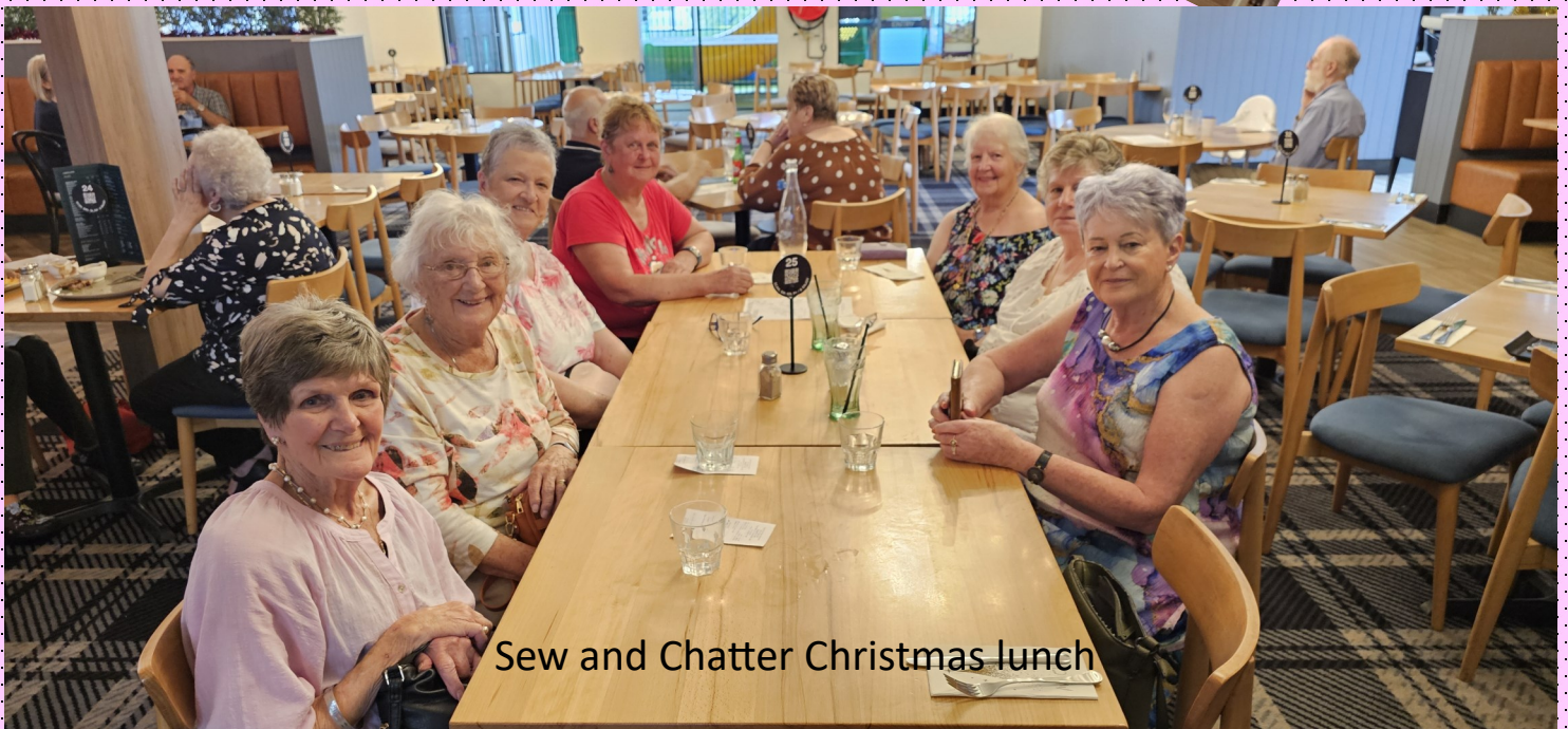
Sew and Chatter Christmas lunch