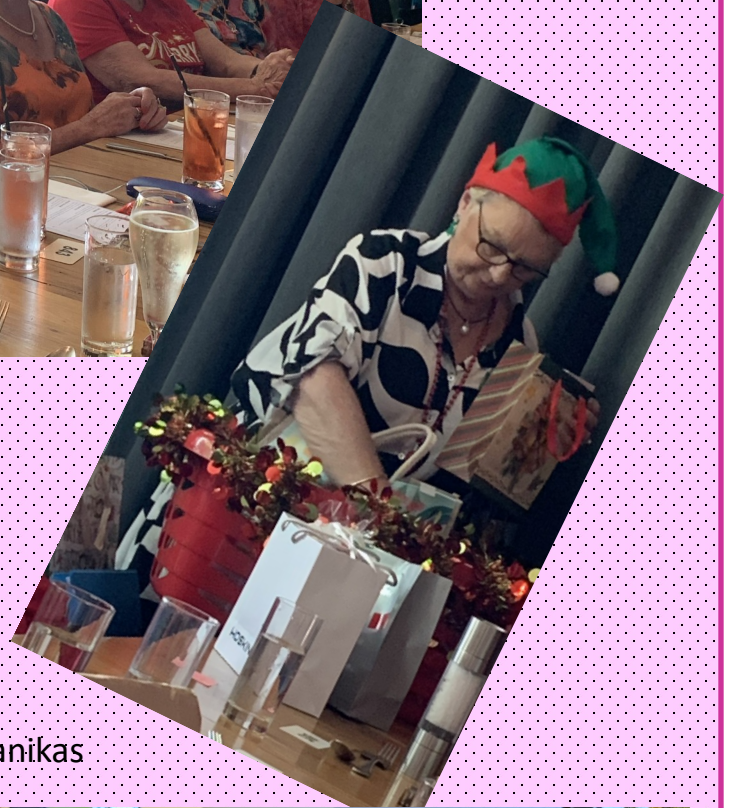
Club Christmas lunch at Shanikas