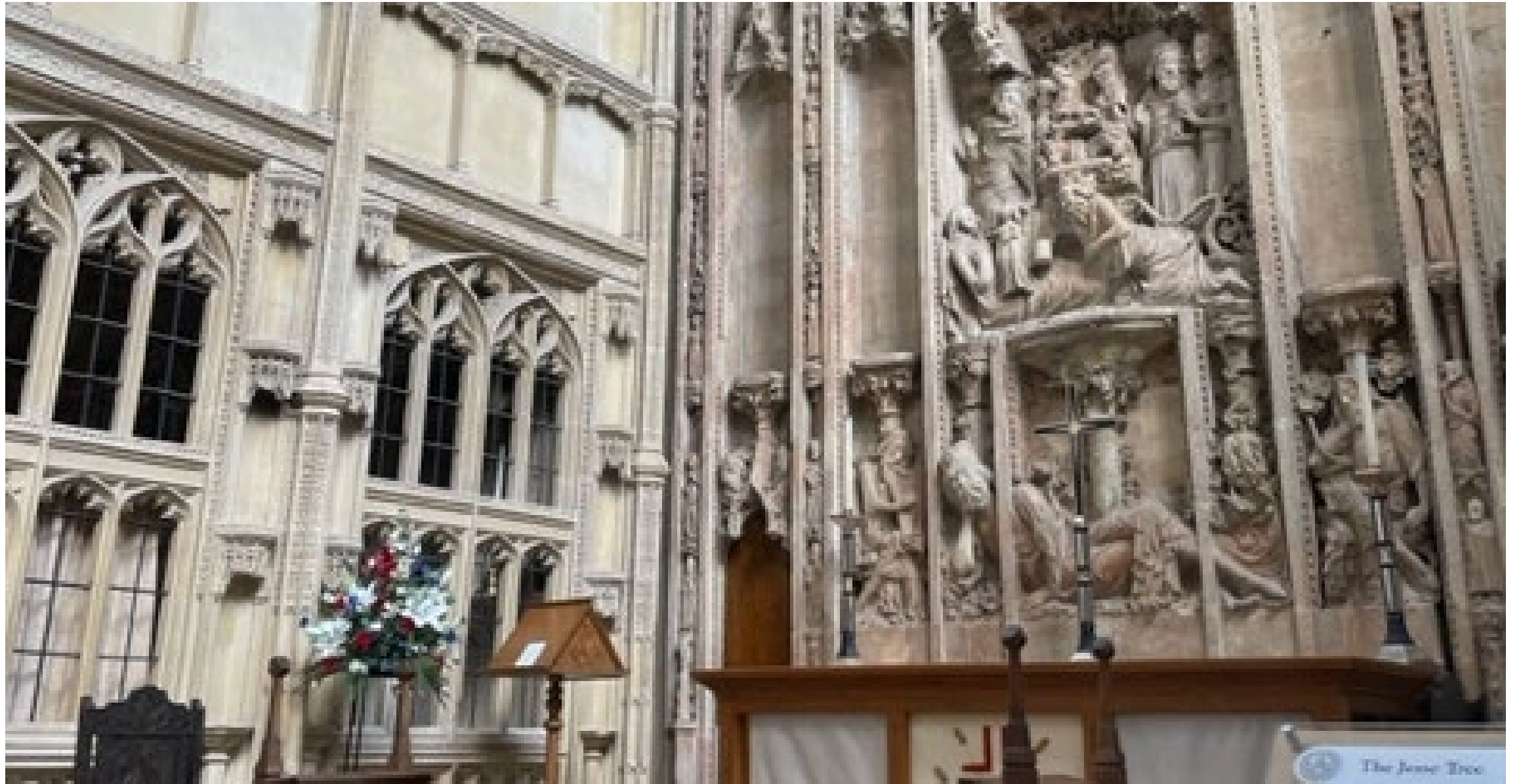
The Jesse Tree