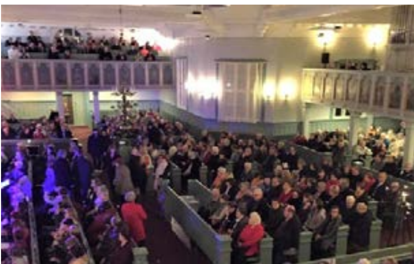
The church managed to give space for 450 persons at the concert in Nurmijärvi.

The concert was sponsored by many local companies so that we could donate a nice amount to the Life Education Foundation in Finland in order to create a new program for multicultural integration in schools and society. The program has a target to increase individual self esteem and give healthy choices for children. In Finland the special teachers of the Foundation reach 110 schools and over 24 000 children each year with this program. The Life Education Foundation in Finland is supported by Inner Wheel, Rotary and other organizations.